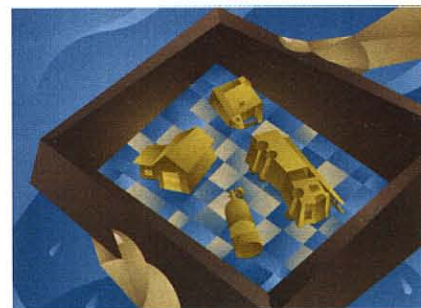
All that glitters