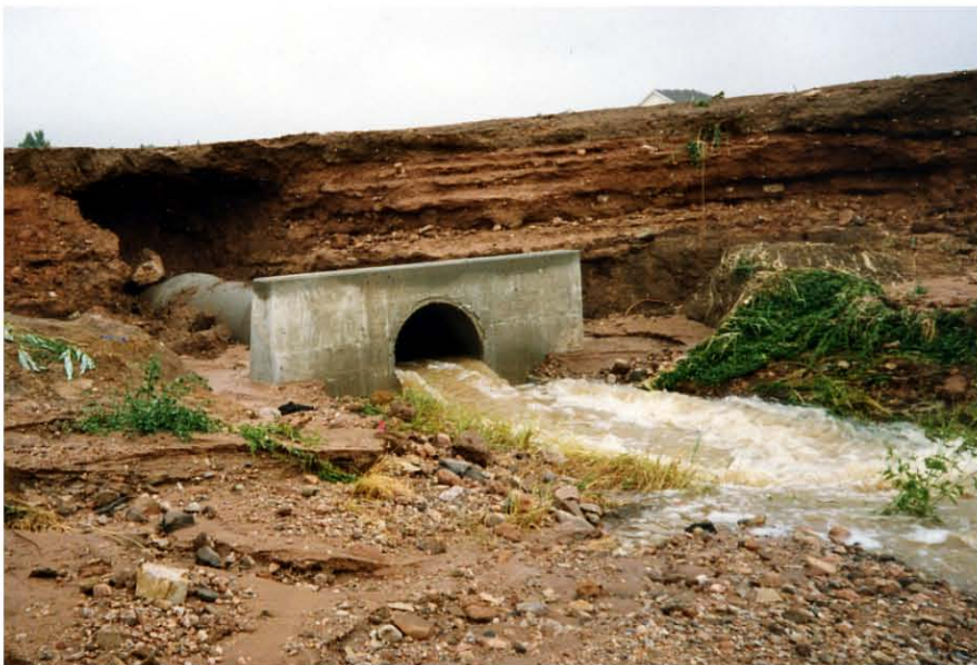
In the early morning hours of July 29, 1997, the devastation is obvious. Here, the east side of the Pleasant Valley and Lake Canal embankment has been scoured away by rushing overflow.

ment staff, especially regarding the issue of recognition.