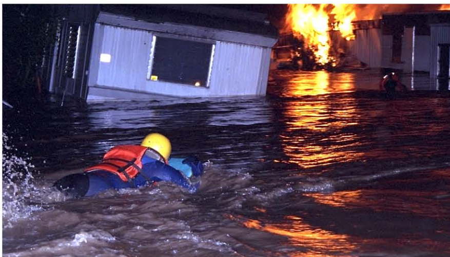
Dive rescue personnel use boogie boards and rafts to assess rescue needs as the crisis in the trailer parks unfolds.

Rain began in the city around 4:30 p.m. Intense upslope flow and increasingly heavy showers continued all night, bringing rainfall totals as high as 3 to 4 inches in western Fort Collins by noon the following day. Similar daily rainfall