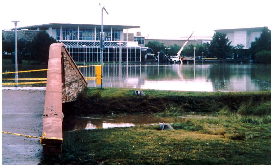
Water pours onto the campus of Colorado State University, where parked cars are caught as the flow increases. The next morning, the Lory Student Center sits in the middle of a lake.

In several cases, firefighters were blocked from reaching one call and diverted on their own to rescue trapped people they encountered elsewhere. Often it would take five minutes or more to get through to the dispatch center and inform them of the change of mission. Fort Collins was now behind the curve, and many firefighters and police officers began searching for and rescuing citizens on their own.